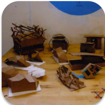
Sketch models from the chicken coop design process, 2011.