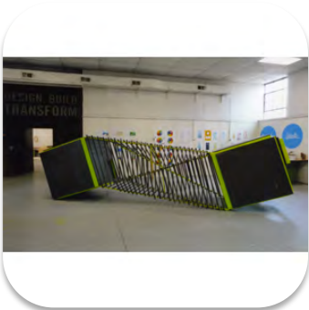
ChickTopia coop, 2011.