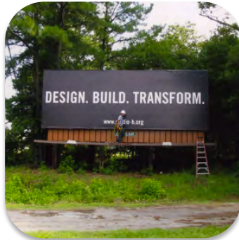
Studio H billboard as you enter Bertie County, North Carolina, 2010.