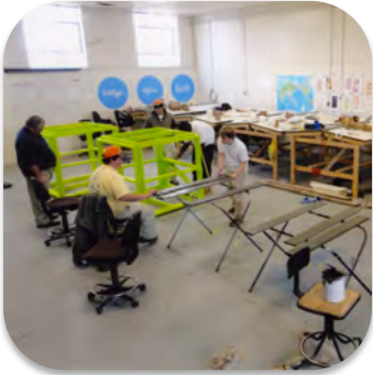
Working in the studio, 2011.

High resolution images available for download on the press center at: http://www.museumofcontemporarycraft.org/press