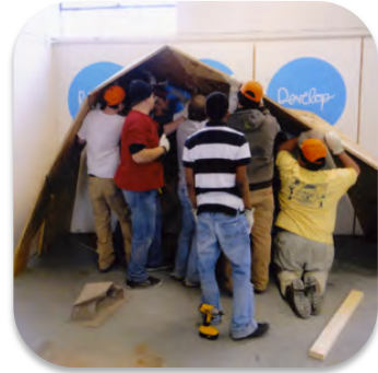
Raising the roof on the Coopus Maximus chicken coop, 2011.